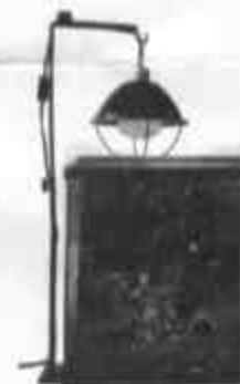
ZOO MED REPTILAMP STAND

This appliance has a POLARIZED plug (one blade is wider than the other). To reduce the risk of electric shock, this plug is intended to fit in a polarized outlet only one way. If the plug does not fit fully in the outlet, reverse the plug. If it still does not fit, contact a qualified electrician. Do not modify the plug in any way.